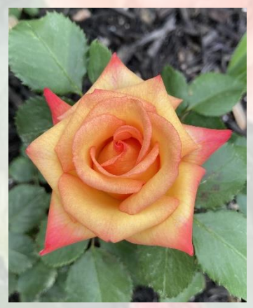
Solar Flair, Photography Bronze Medal, Glenn Hodges