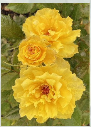
Sunsprite, Photography King and Gold Medal. Glenn Hodges